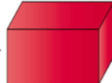
Color the Rectangular Prisms Red