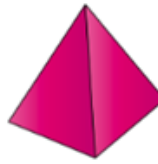
Color the Pyramids Pink