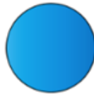
Color the Spheres Blue