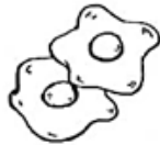
Half fried eggs