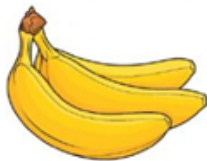
Fruit and Vegetables