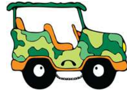
j e e p