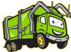
g a r b a g e t r u c k