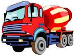
c e m e n t t r u c k