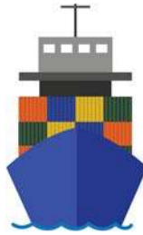
s h i p