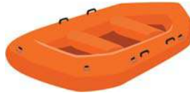
r a f t