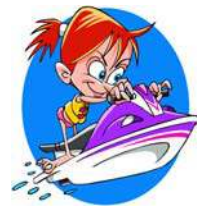
j e t s k i