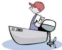
m o t o r b o a t