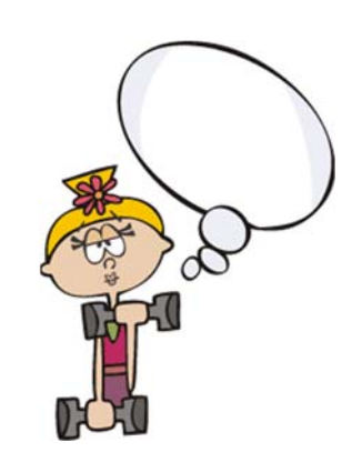
A red flower is _____ her dress. One barbel is _____ her shoulder.